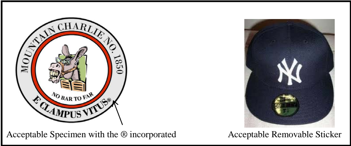
Acceptable Specimen with the ® incorporated