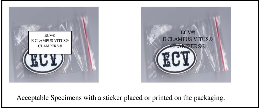
Acceptable Specimens with a sticker placed or printed on the packaging.